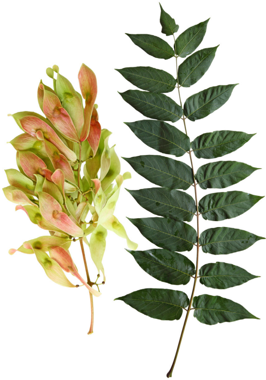
Close-up of a leaf and fruit cluster from the tree-of-heaven and a mature tree shown below.