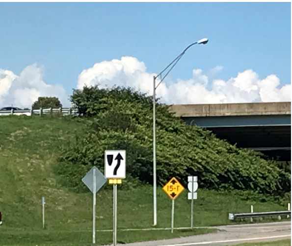
This photo shows the spread of Japanese Knotweed on the side of a roadway.