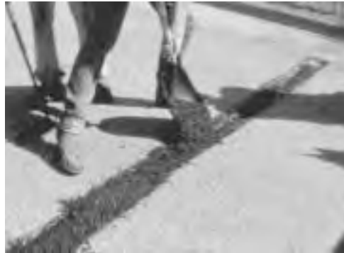
3 Place hot mix neatly in reservoir.