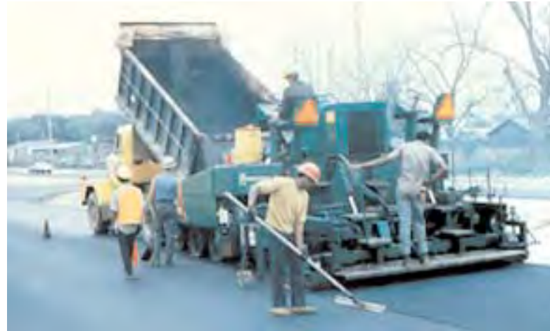
Specification 2350 is the recommended mixture. Place with a paver.