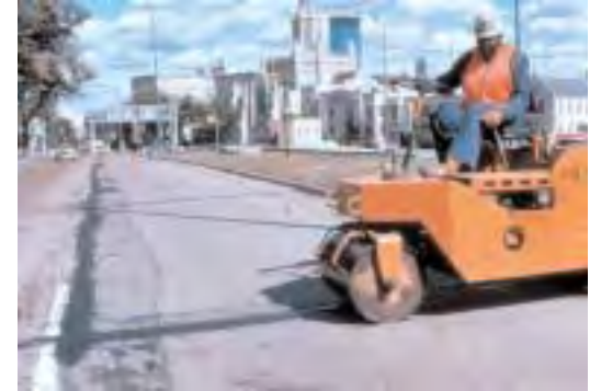
4 Compact the hot mix with roller so that patch is flush with adjacent pavement.