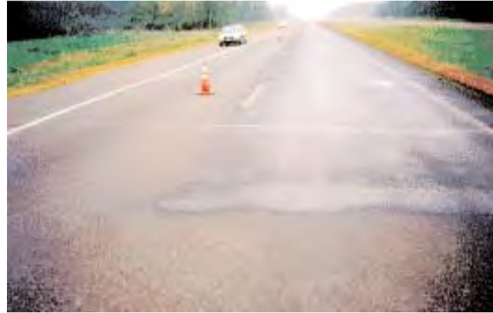
Fog seal just applied, prior to cure