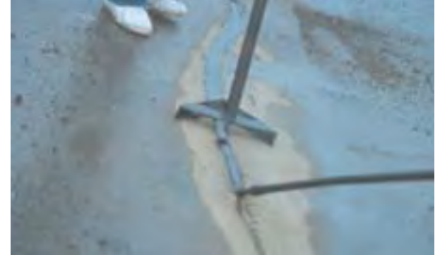
3 Strike off sealant with squeegee to create overband.