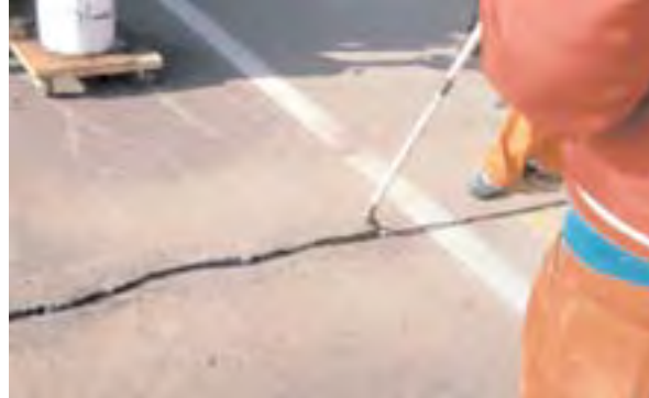
2 Fill clean crack with sealant.