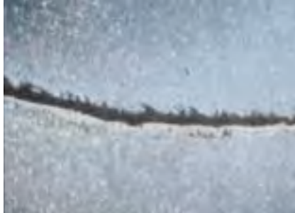
2 Remove debris before placing sealant.