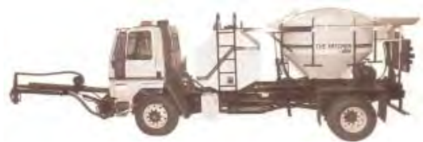
3 Spray injector