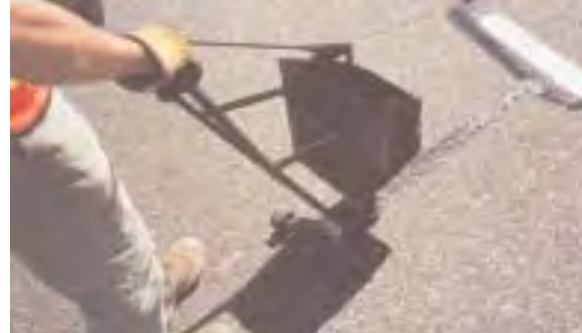
3 Place sealant meeting Mn/DOT spec. 3725.