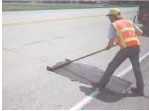
2 Strike off slurry material.