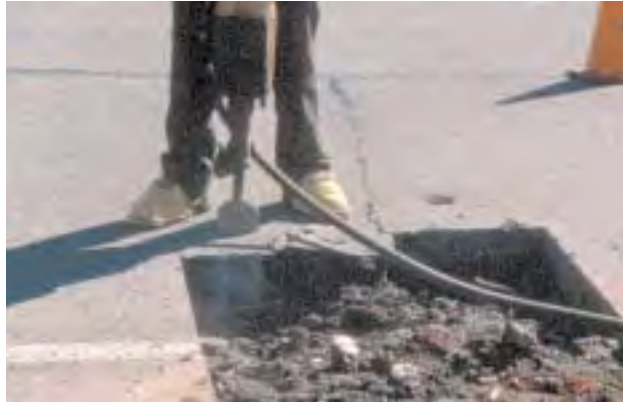
2 Remove as much pavement as needed to reach firm support.