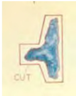
1 Mark area to be patched, extending at least 1 foot outside the distressed area.