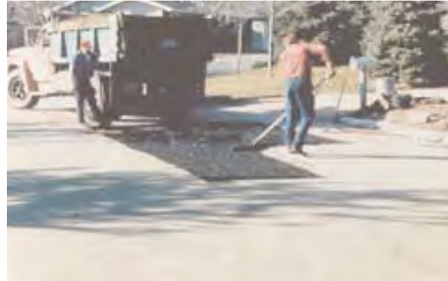
3 Place patching material in hole and compact.