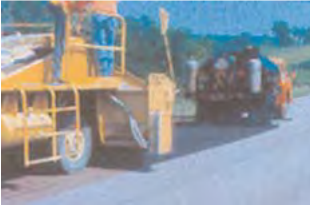
1 Minimize the distance between the binder distributor and aggregate spreader.