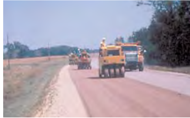
2 Use a minimum of three rubber-tired rollers, all at 5 mph maximum speed.