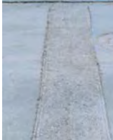
2 A clean reservoir ready for new hot mix