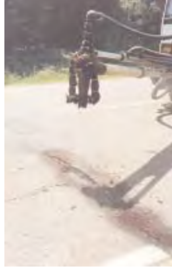
2 Spray injection patching used on a pothole