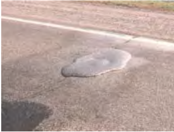
1 Deposit sufficient slurry to fill crack.