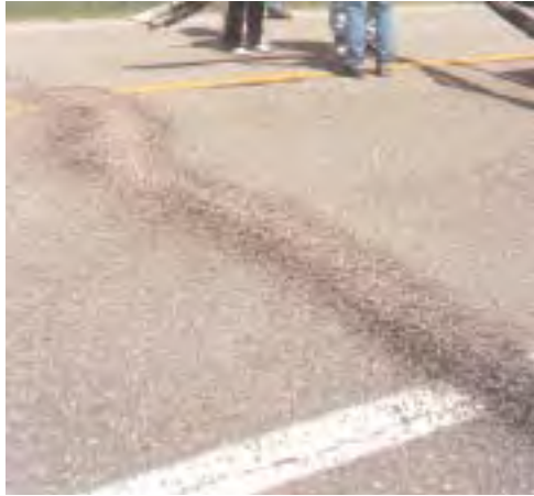
1 Spray injection crack repair

Spray injection patching , also referred to as blow patching, uses air pressure to apply asphalt emulsion and aggregate into large cracks and potholes.