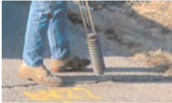
1 Dry thoroughly with hot-air lance or high-pressure air hose.