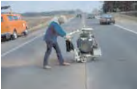
1 Rout cracks.