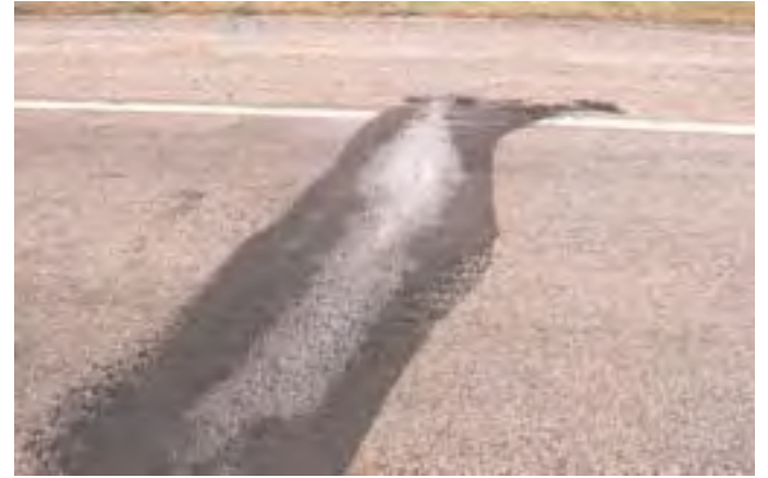
3 Completed repair