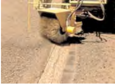
1 Mill and sweep crack to remove any loose material.