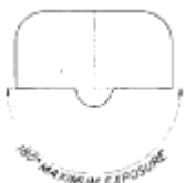
Figure No. P-5