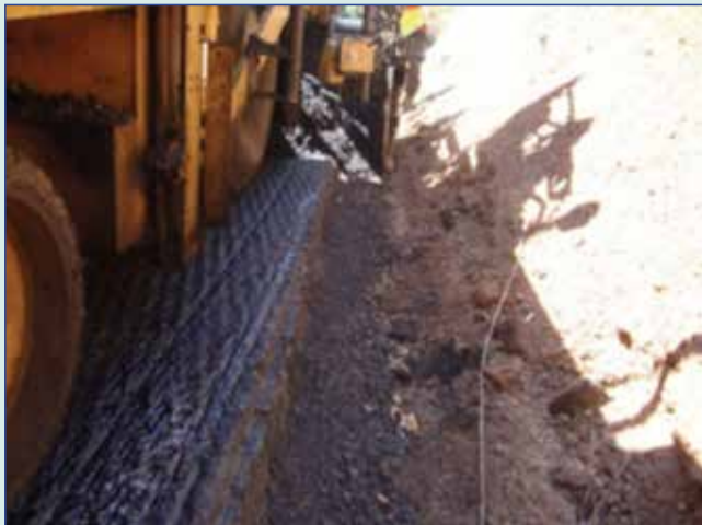
Mountain Ranch Road, Calaveras County (August 2012)

The Safety Edge SM is manufactured by four different companies. The instructions for installing and use of each are fairly straight forward. Preparation of the shoulder and engagement of the Safety Edge SM are most critical to a successful end product.