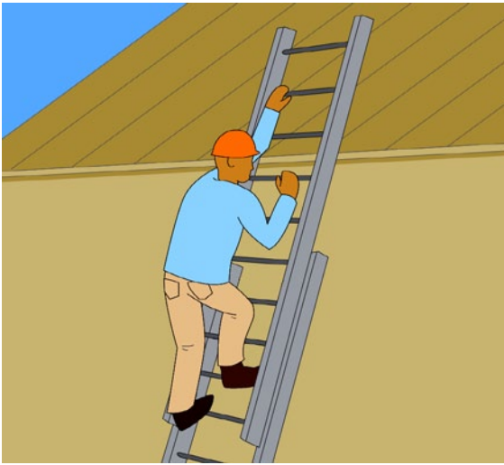
Figure 2: Ladder extending three feet above the landing area.