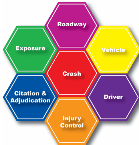
Figure 1: The Traffic Records System

Figure 1 depicts the relationships among these systems as an interlocking set of related information. For traffic safety purposes, crash data is at the center of this honeycomb of information; while all of the other databases are integrated with or linked to the crash data.